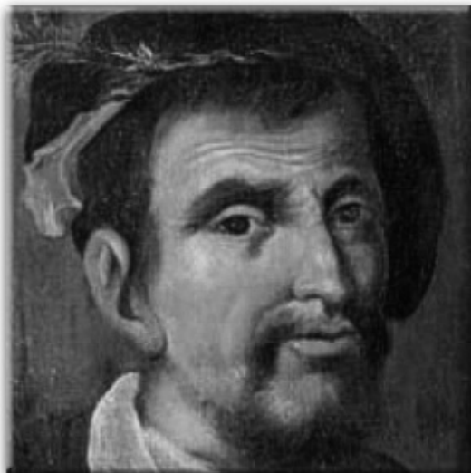
Hernando, el Colón Cordobés

<!--[if gte mso 9]> <o:OfficeDocumentSettings> <o:AllowPNG/> </o:OfficeDocumentSettings> <![endif]-->